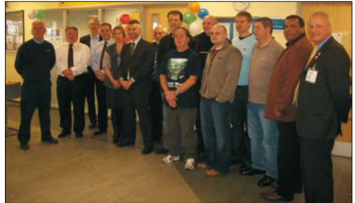
Management, ULRs, BFAWU Officials & Learning Services Working in Partnership