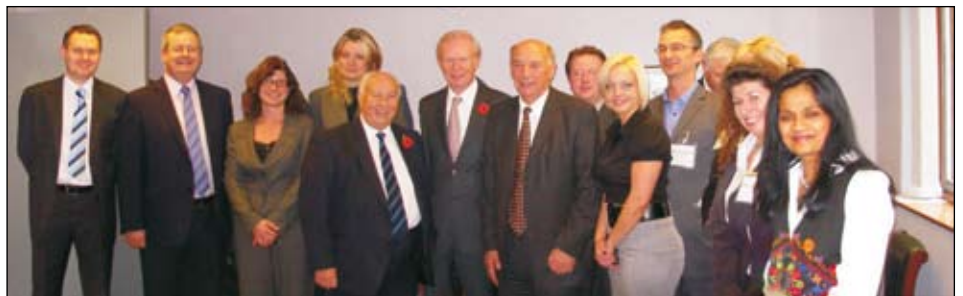
The Team at O'Kanes

On Thursday 6 th November we held a small official open day of the learning centre in O'Kanes. Sir Reg Empey, Minister for the Department of Employment and Learning, attended this event and it was a proud day for everyone involved in the set up of the centre. The minister had the chance to speak first hand with learners that are currently on the essential skills classes and get feedback from them. The open