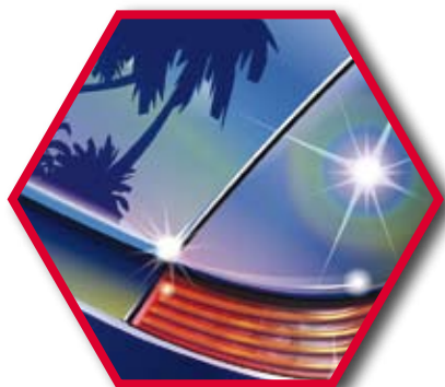
Changing the car