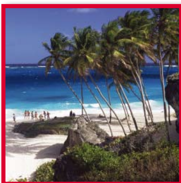
The holiday of a lifetime

WHATEVER YOUR NEED, WE ARE HERE FOR YOU TO JOIN THE CREDIT UNION CALL US ON 0161 848 9879