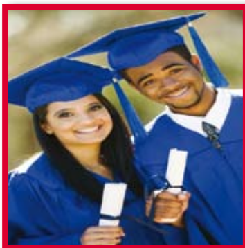
Saving for your family