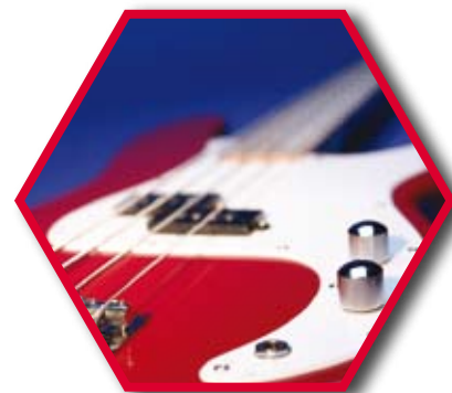
A new hobby