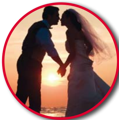
That special day

For saving or to loan Choose the bank you own YOUR CREDIT UNION